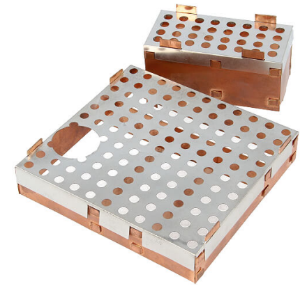
1600 series Fixed PCB shields with a lid with cooling holes and a cutout according customers drawing