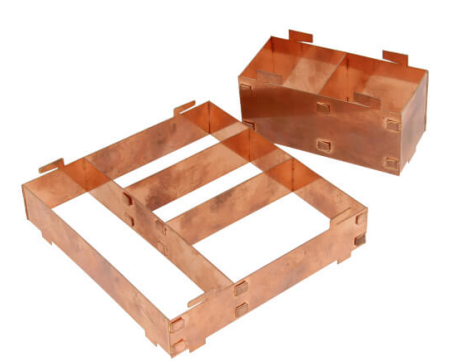
1600 series Fixed PCB shields used to make EMI/RFI shielded compartments on a printed circuit board

For a price request, we ask you to send us a email to info@hollandshielding.com with your technical drawing in for example .dwg .dxf .pdf or a similar file format made up in vectors. You can also use the quotation section below.