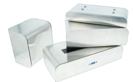
Some example of custom-made XYZ shielding enclosures for EMI shielding