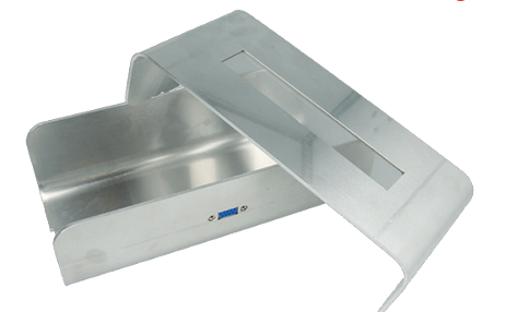
Example of a XYZ Shielded enclosure with the enclosure open

Infratron GmbH · Tel.: 089/158 126-0 · Web: www.infratron.de · E-Mail: info@infratron.de