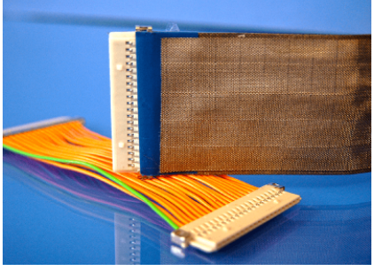
Flexible cable shield is also easy to mount on ribbon cables, without affecting the cables' flexibility